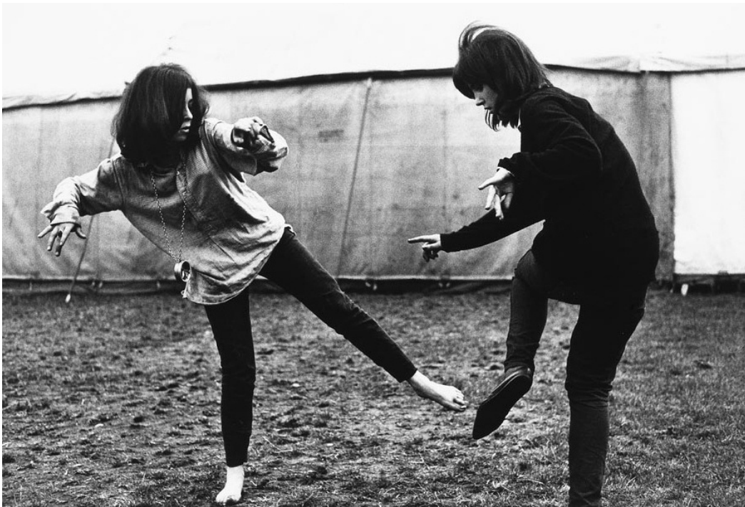
Girls jiving at the Richmond Jazz Festival